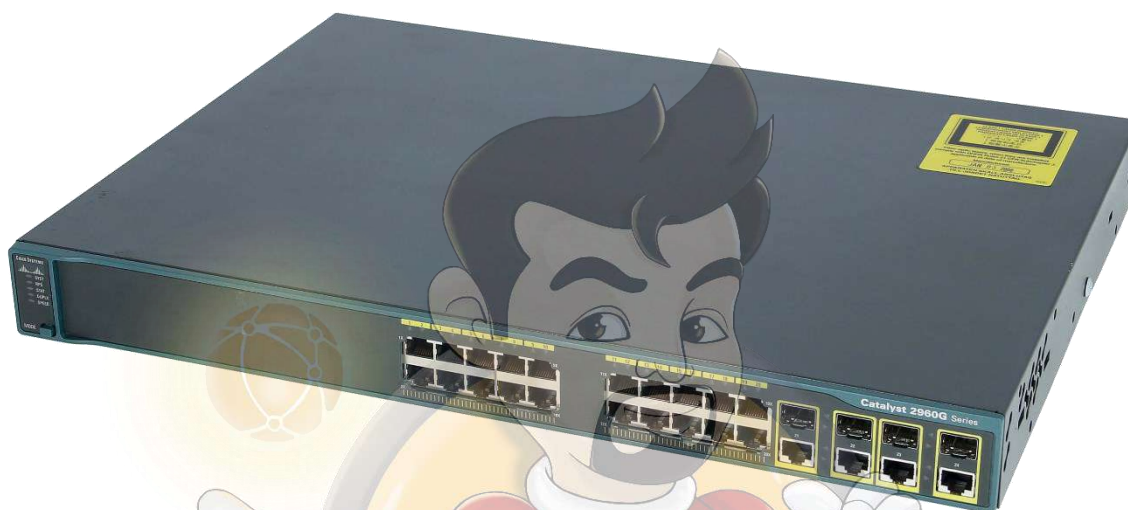
Table 1 shows the Quick Spec of the Cisco 2960G-24TC-L switch.

Figure 1 shows the appearance of the Cisco WS-C2960G-24TC-L switch and its cable