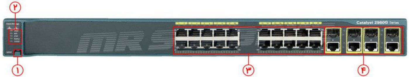
Figure 2 shows the front panel of the Cisco 2960-24TC-L switch.